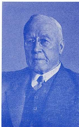
Sir John Latham

We look forward to the future happy in the knowledge that our Patron will guide and help us in our social work endeavours, and we take this opportunity of expressing our deep appreciation of the kindness Sir John has shown us.